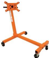
Hydraulic Engine Crane and Tilter, (2 each)