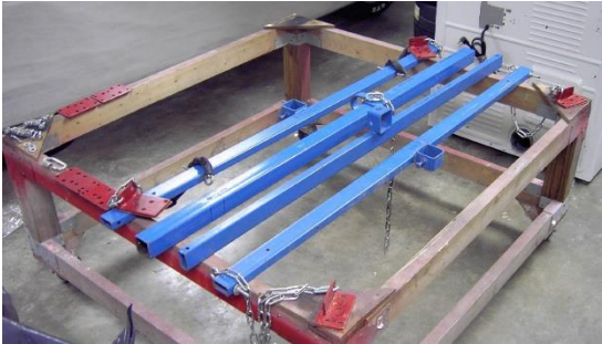
Solid Axle Rebound Strap Riveting Tool